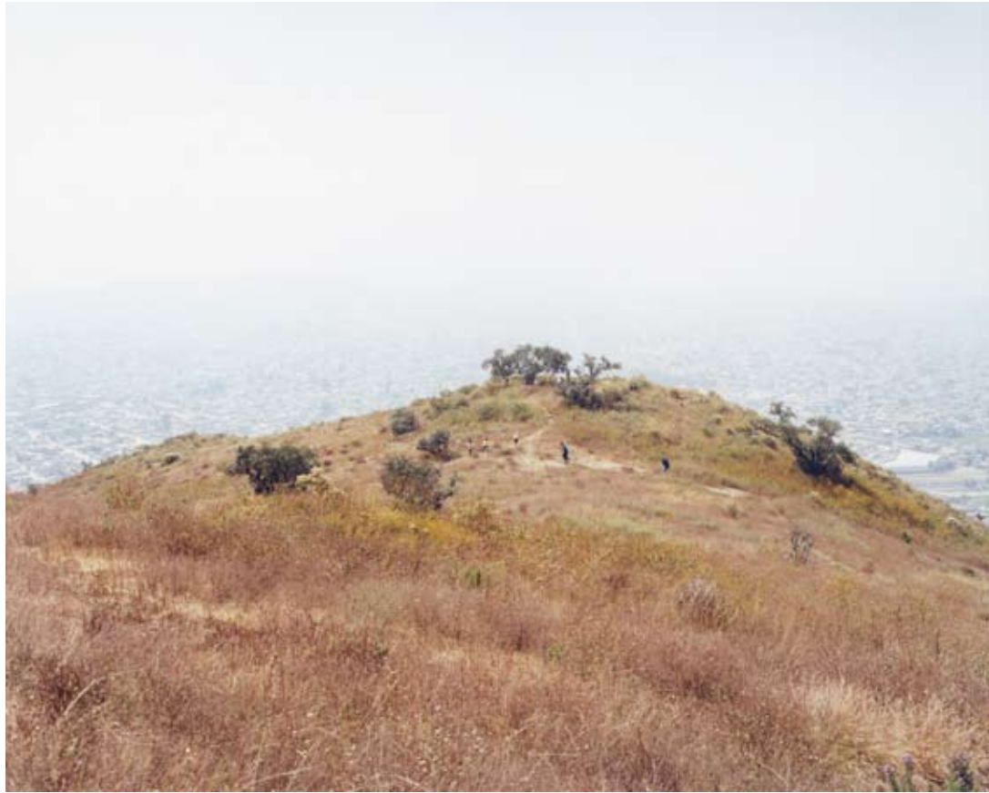
Cerro Elefante, Ixtapaluca, 2004