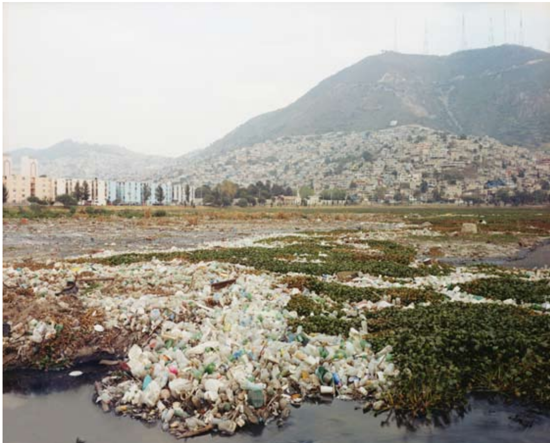
Cuautepec, Disscarica, Mexico City, 2004